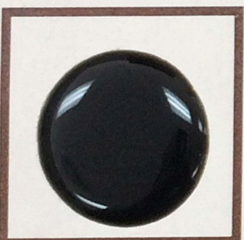
DP-125 GRAY EPOXY ADHESIVE • Medium Worklife • Good Peel