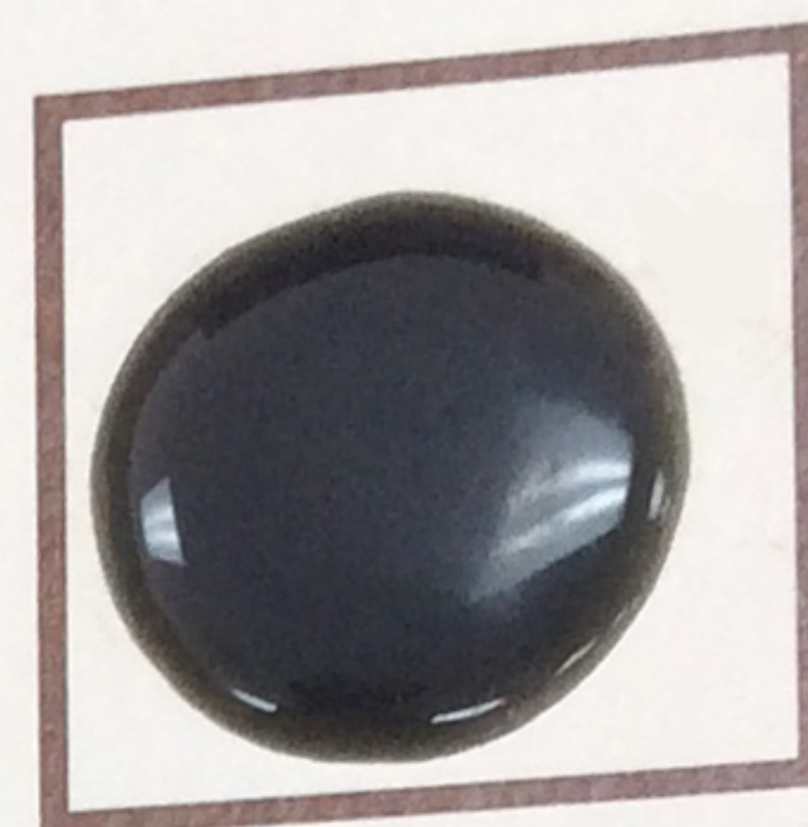
DP-100 PLUS GRAY EPOXY ADHESIVE • Fast Cure • High Peel and Shear Strength