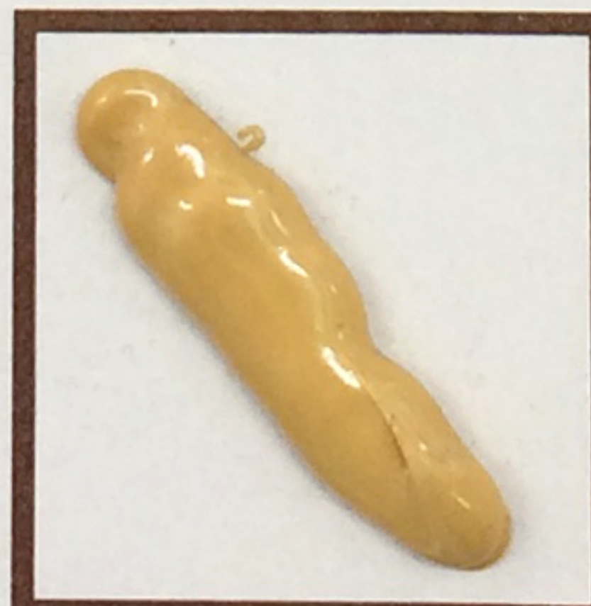
DP-605 NS OFF-WHITE URETHANE ADHESIVE • Fast Cure • Non-Sag • Good Filler