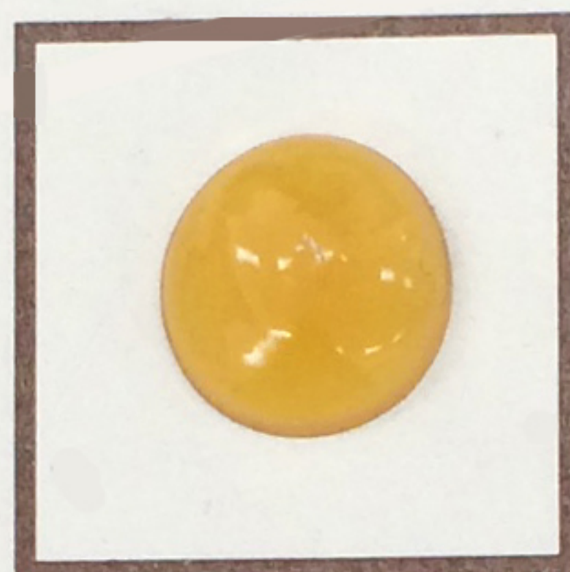
DP-110 TRANSLUCENT EPOXY ADHESIVE • Medium Worklife • Controlled Flow • Good Peel Strength