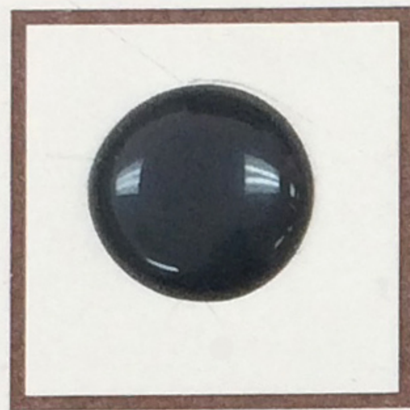
DP-105 GRAY EPOXY ADHESIVE • Fast Cure • Very Flexible