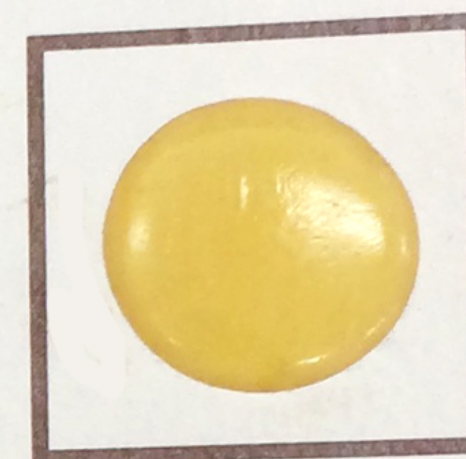
DP-125 TRANSLUCENT EPOXY ADHESIVE • Medium Worklife • Good Peel