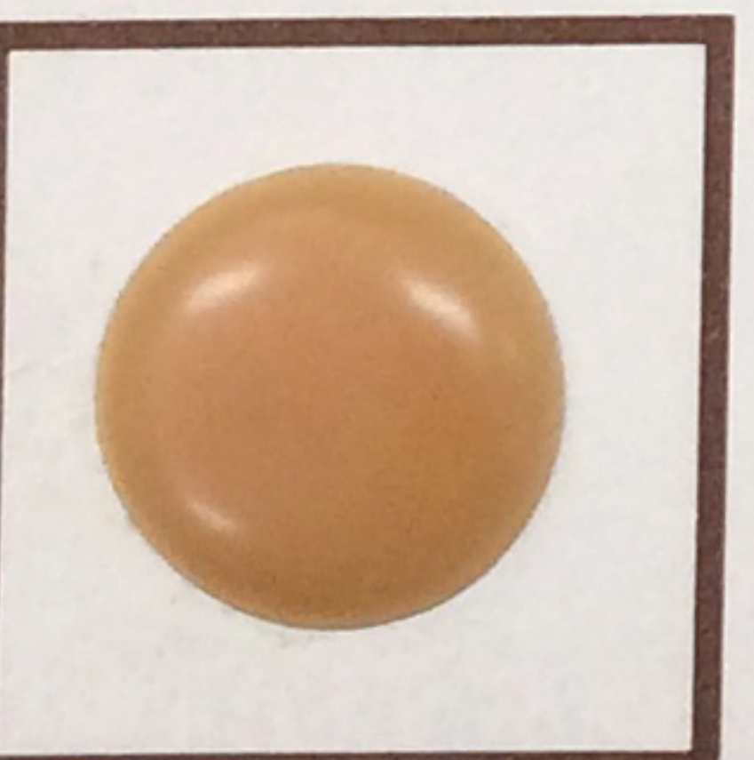
DP-420 OFF-WHITE EPOXY ADHESIVE • Medium Worklife • Very High Peel and Shear