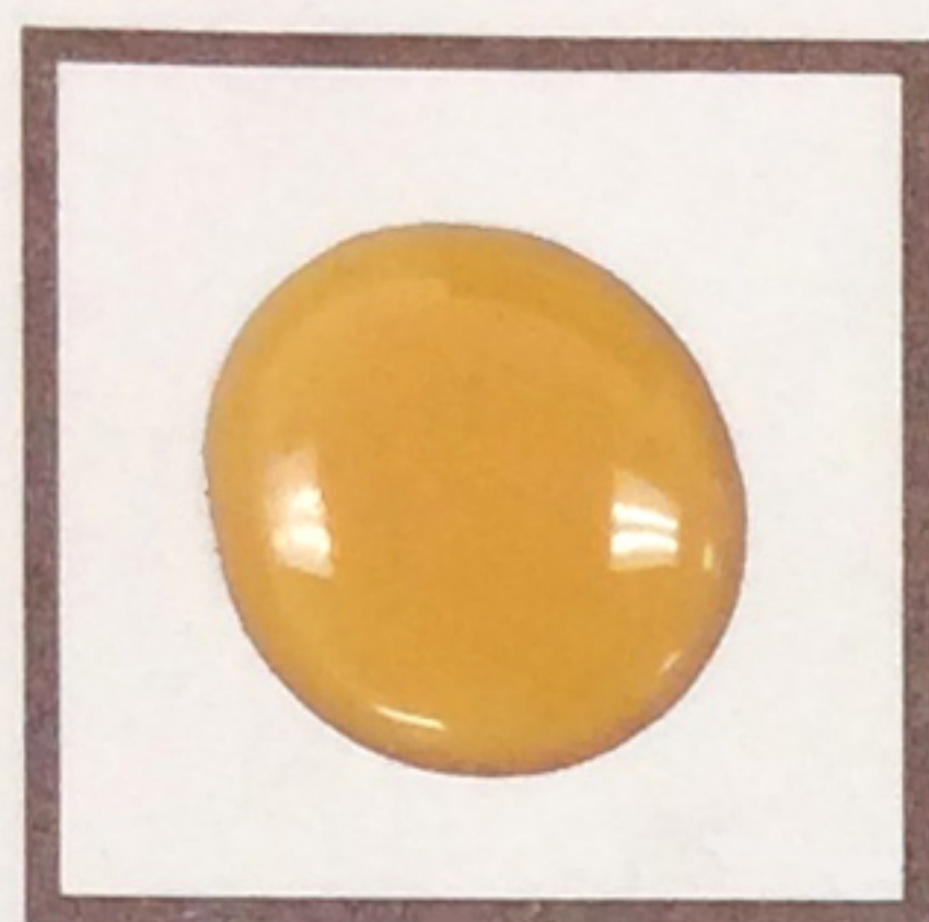
DP-100 CLEAR EPOXY ADHESIVE • Fast Cure • Flowable