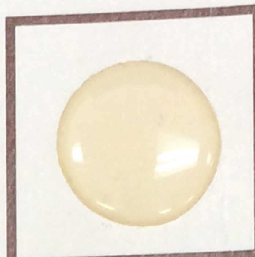
DP-100 PLUS CLEAR EPOXY ADHESIVE • Fast Cure • High Peel and Shear Strength