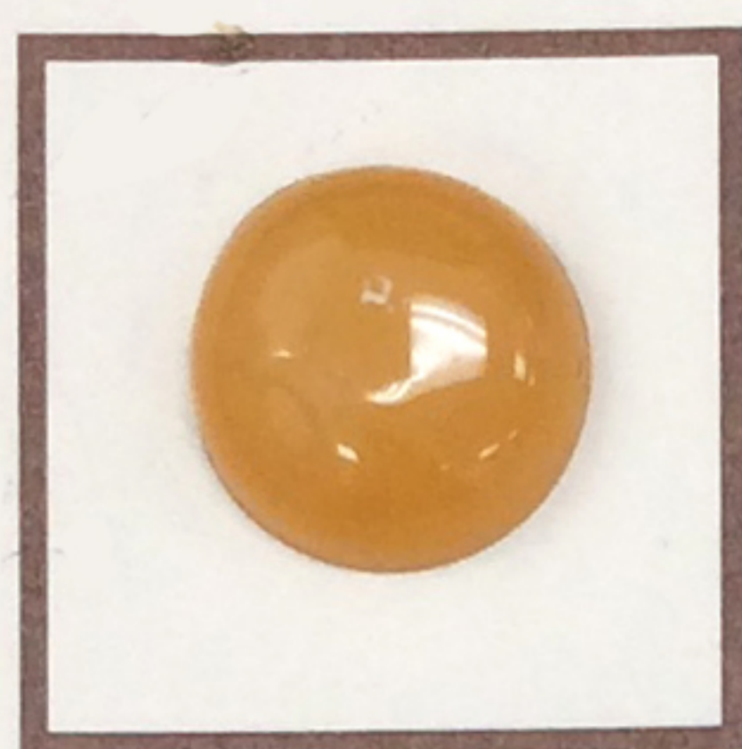
DP-100 NS TRANSLUCENT EPOXY ADHESIVE • Fast Cure • Low Flow