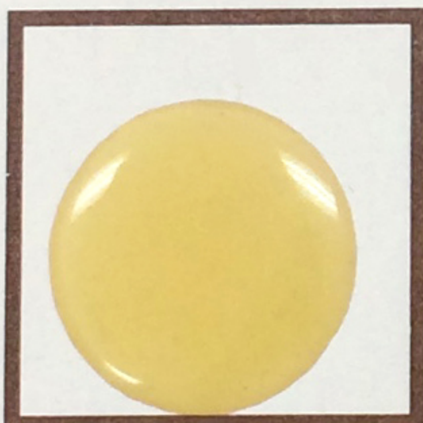
DP-190 TRANSLUCENT EPOXY ADHESIVE • Long Worklife • Good Peel