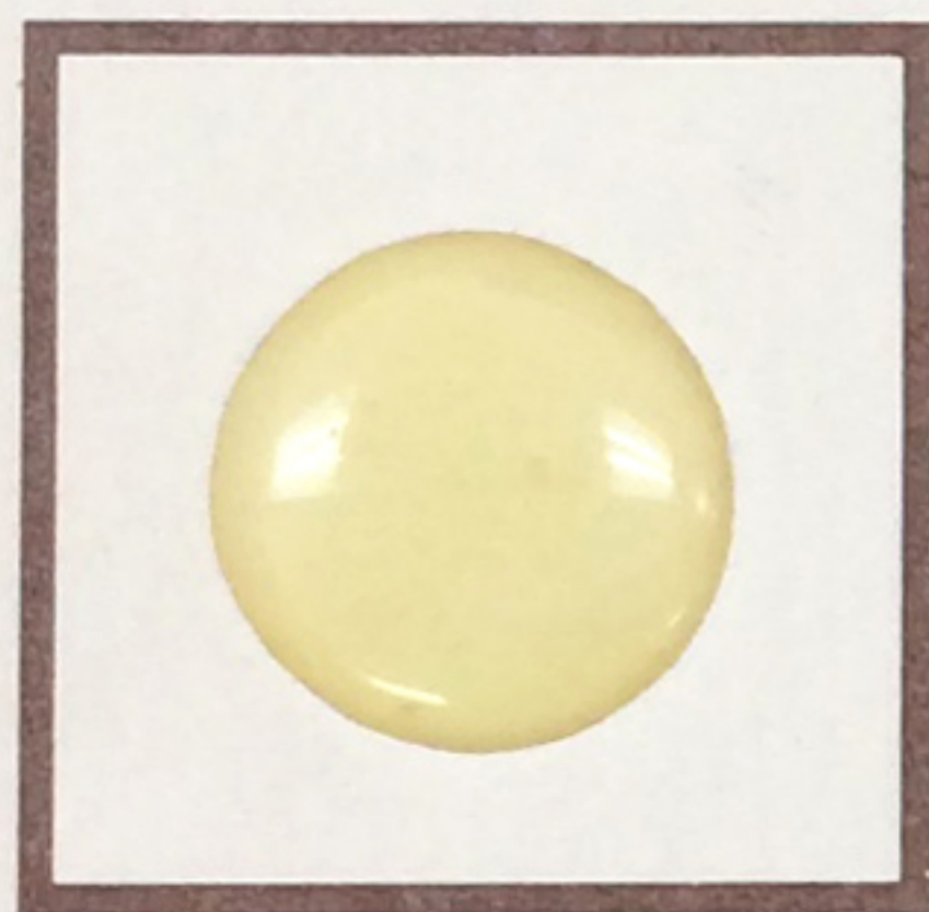
DP-105 CLEAR EPOXY ADHESIVE • Fast Cure • Very Flexible