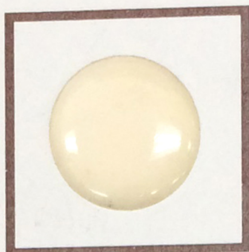
DP-100 FR OFF-WHITE EPOXY ADHESIVE • Fast Cure • Fire Retardant