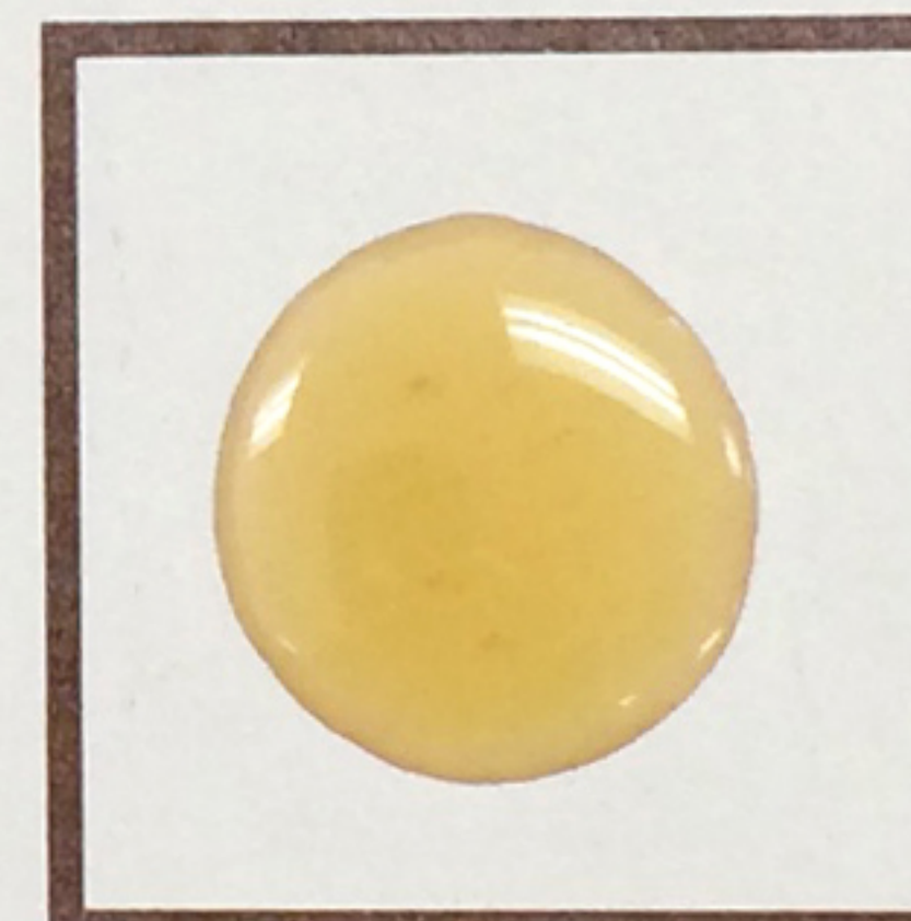
DP-270 CLEAR EPOXY POTTING COMPOUND/ADHESIVE • Noncorrosive to Copper • Very Flowable