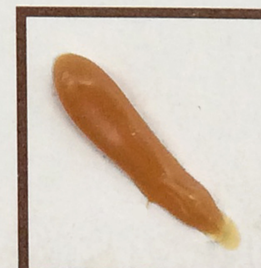
DP-805 YELLOW ACRYLIC ADHESIVE • High Peel and Shear • Bonds Slightly Oily Metal