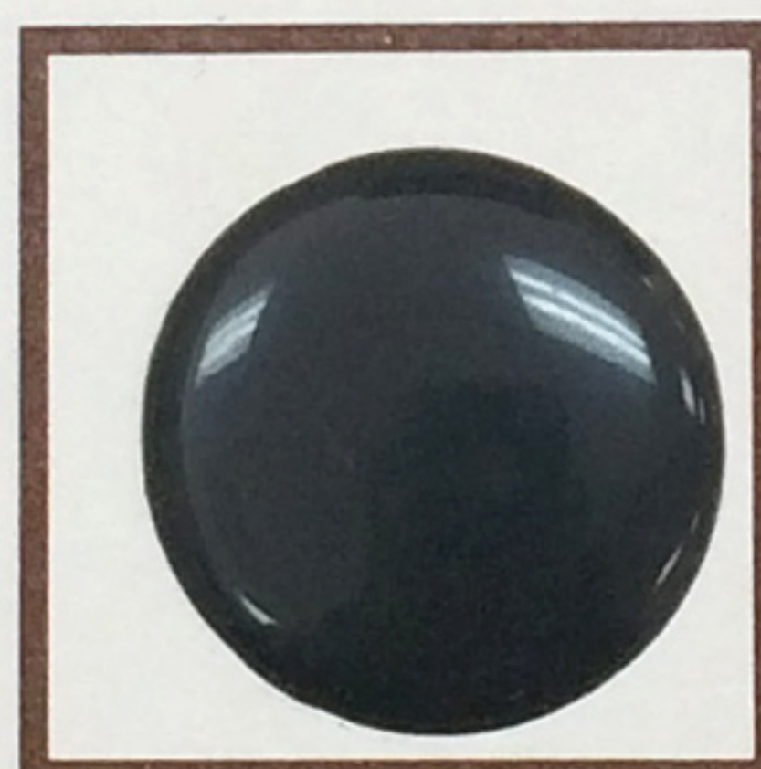
DP-190 GRAY EPOXY ADHESIVE • Long Worklife • Good Peel