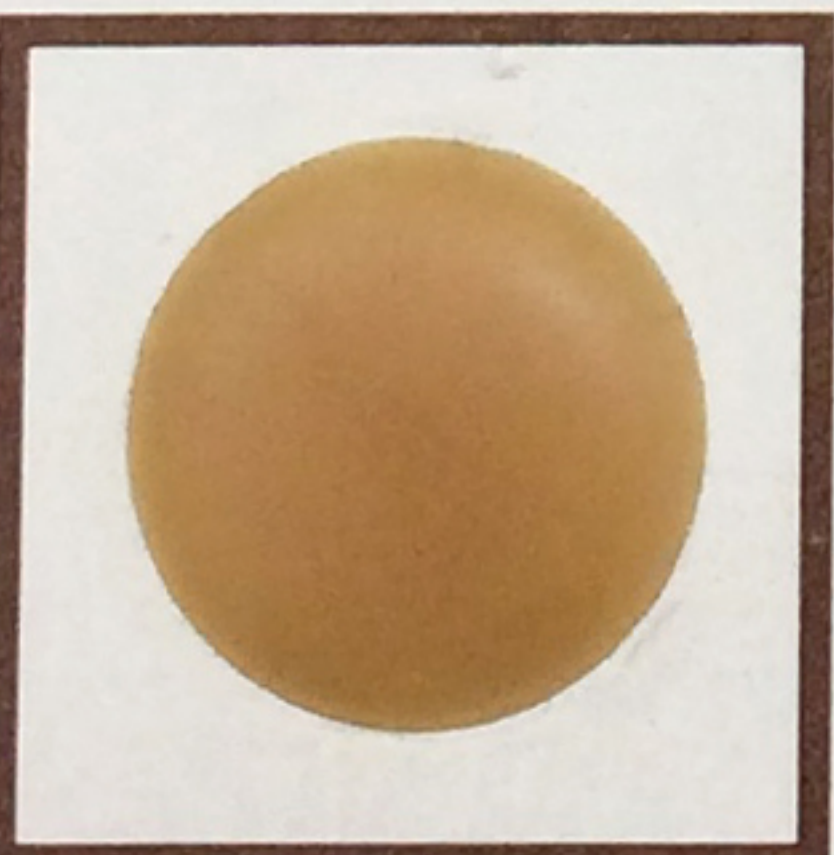
DP-460 OFF-WHITE EPOXY ADHESIVE • Long Worklife • Very High Peel and Shear