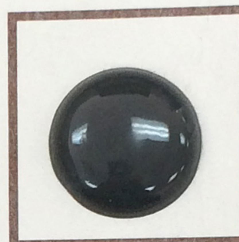
DP-110 GRAY EPOXY ADHESIVE • Medium Worklife • Controlled Flow • Good Peel Strength